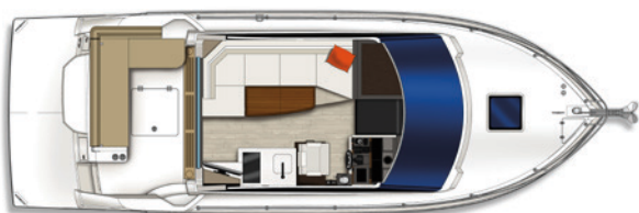
Upper Deck Level