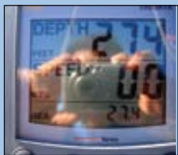
WOW! Check out the water temp. in Desolation Sound! Image taken July 5th, 2006.

for the night or carry on to the anchorage in Roscoe Bay (check the tides as it shallows out in the entrance). The warm waters of Black Lake await you only a 5 minute walk from the anchorage.