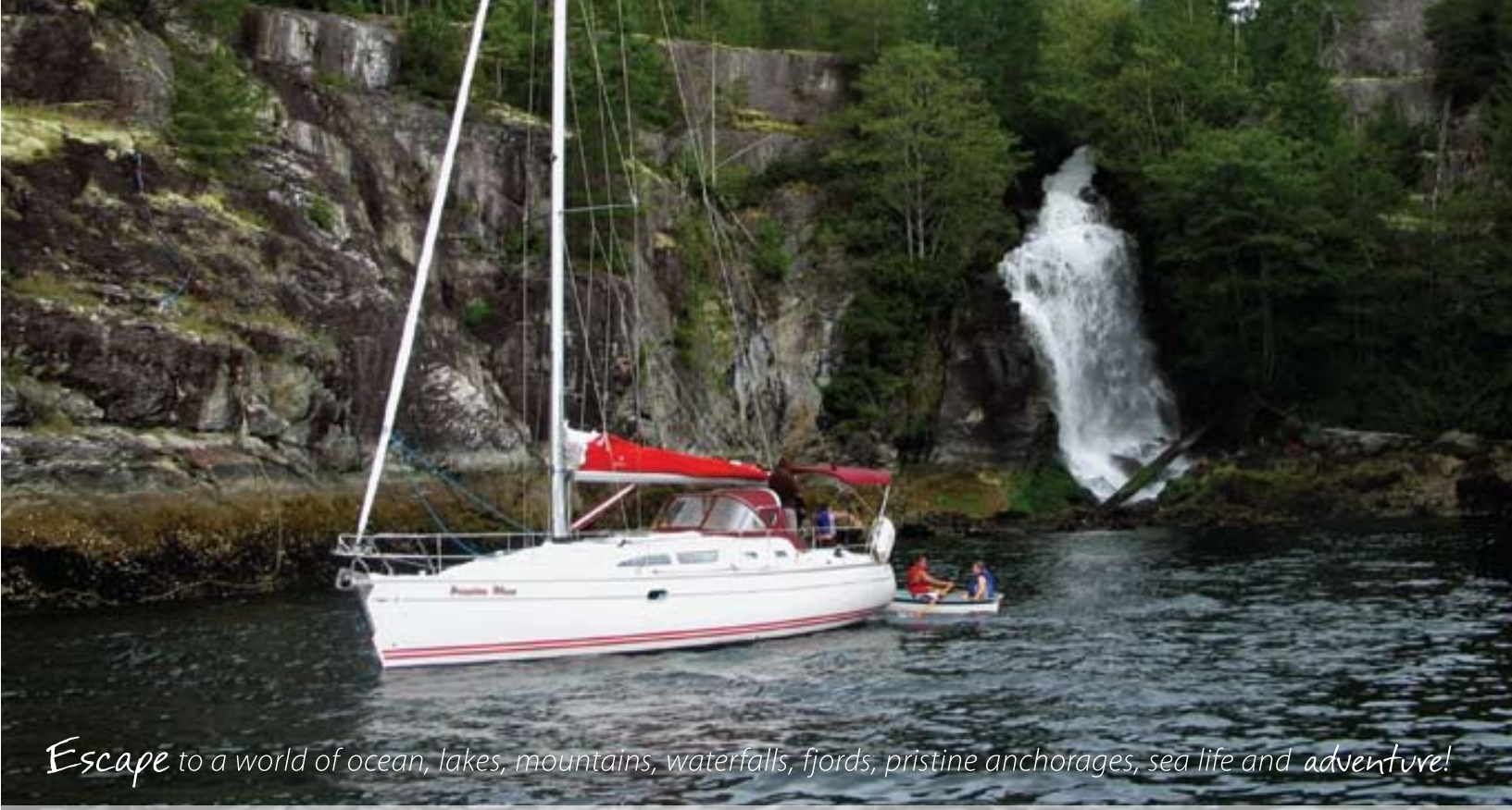
Escape to a world of ocean, lakes, mountains, waterfalls, fjords, pristine anchorages, sea life and adventure!

DAY 8 - Depart Lund for a short stop at Savory Island (the jewel of the Georgia Strait) and quick dip before embarking on a brisk sail back to Pacific Playgrounds. Relax aboard for your final evening or hike the trail to the Salmon Point or Fisherman's Pub.