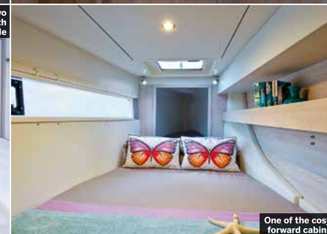
One of the cosy forward cabins