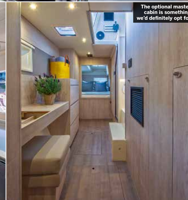
The optional master cabin is something we'd definitely opt for