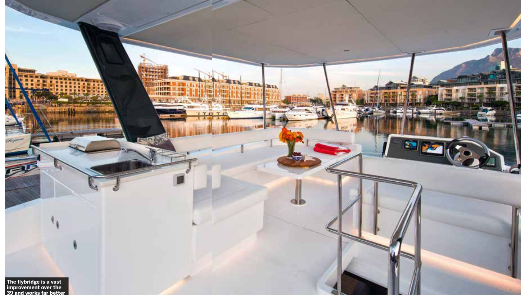
The flybridge is a vast improvement over the 39 and works far better

The hose-down nature of a charter-spec boat won't appeal to everyone and private owners will probably want to add a few more splashes of teak and upholstery in the cockpit, but the interior especially feels so much more sophisticated than the 39.