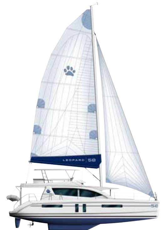
LEOPARD | 58