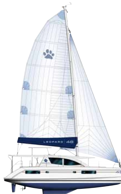
LEOPARD | 48