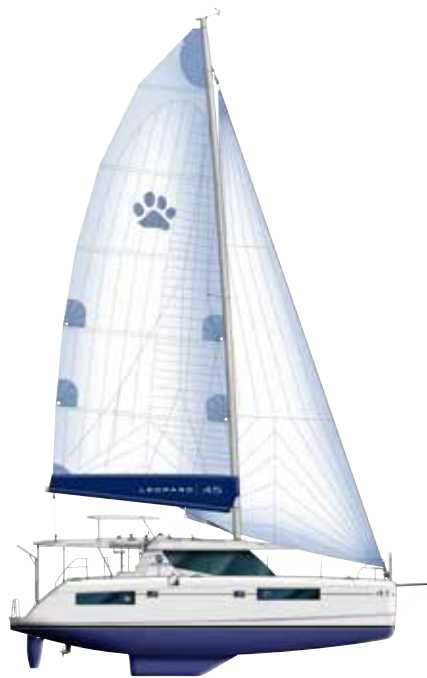
LEOPARD | 45