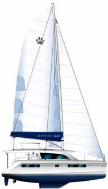
LEOPARD | 40