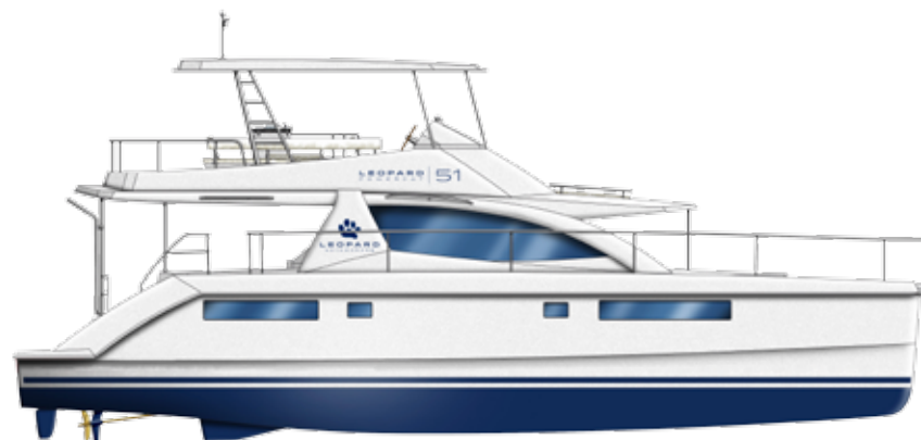
LEOPARD POWERCAT | 51