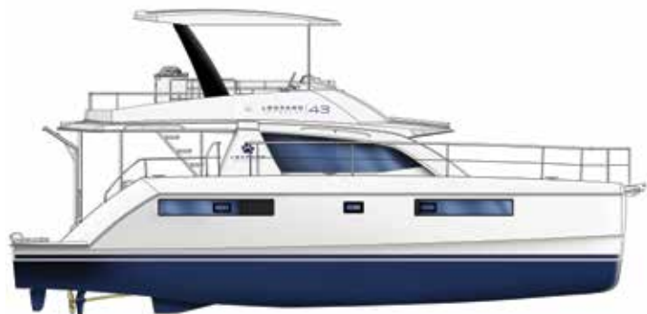
LEOPARD POWERCAT | 43